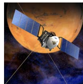
Figure 2. Illustration of Mars Express satellite